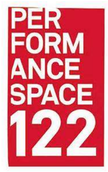
Logo PS 122