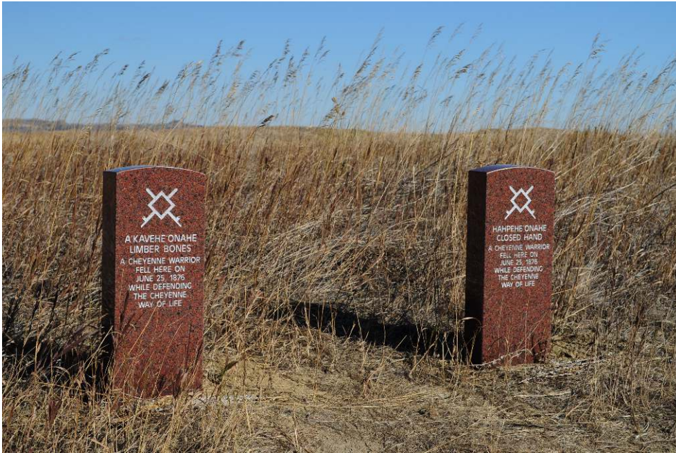
No. 4 2009.