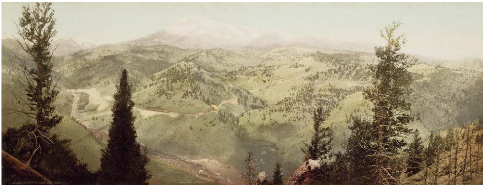
IMAGE: 20.3 x 53.7 CM (18 x 21 1/8 IN.)

No. 1 William Henry Jackson, photographer (American, 1843-1942) Marshall Pass, Colorado, 1899, Photocrome print